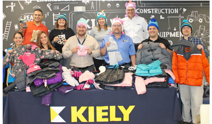
J.F. Kiely Construction Co. employees donated over 160 new coats and winter outerwear to the 2019 Warmest Wishes Coat Drive.

Thank you to J.F. Kiely Construction Co. for your hard work and dedication in delivering goodwill to our community!