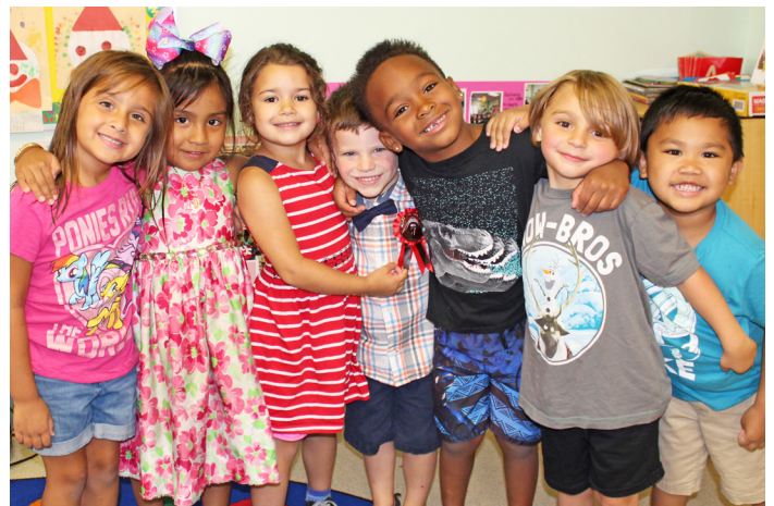
Students in the summer literacy program hosted by UWMOC's partner O.C.E.A.N. Inc. in Toms River.

practices and challenges in order to strengthen the program for Summer 2020.