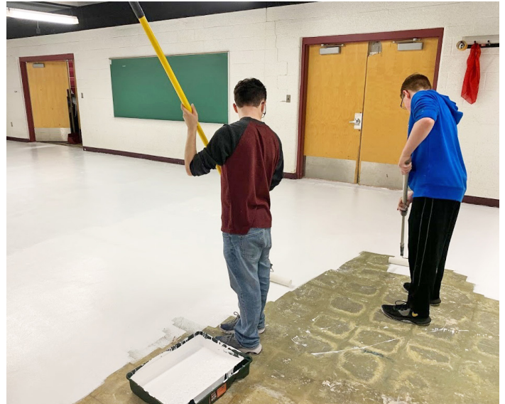
Students in Project SPEAR-IT worked hard to prepare the space in Toms River High School South that will host the program.

dropout rates. As part of the grant from UWMOC, HSS will remodel a space that is dedicated to the program, and facilitate at least 10 field experiences for students. The grand opening of the remodeled classroom will be announced this year, and we welcome the community's involvement in celebrating this new and exciting initiative.