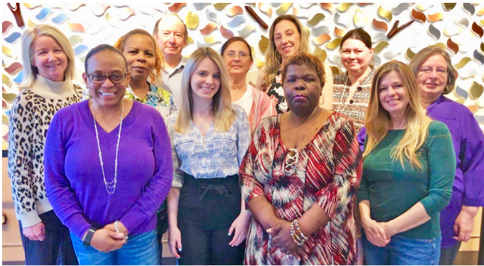
Participants in a financial education workshop series graduated after completing the four-week program hosted by FSC Network partner Affordable Housing Alliance.

The FSC Network is a partnership of nine organizations: Affordable Housing Alliance, Child Care Resources of Monmouth County, Fulfill, Mental Health Association of Monmouth County (MHAMC), Monmouth County Workforce Development Board, Navicore Solutions, Social Community Activities Network (SCAN), St. Francis Community Center (LBICC) and UWMOC.