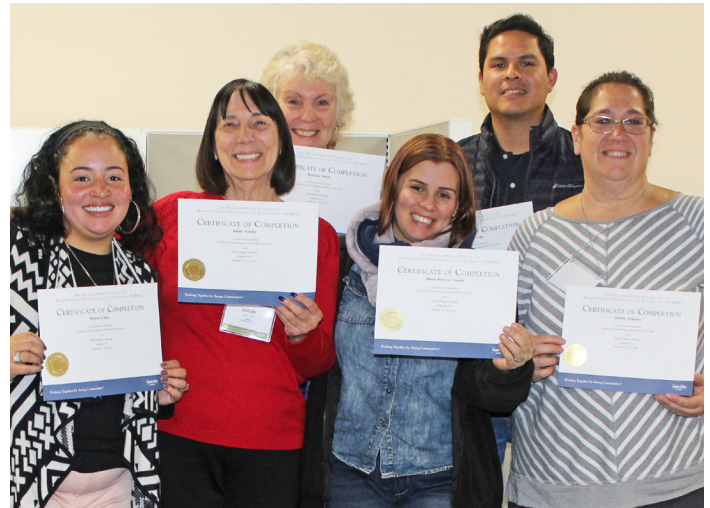
In partnership with Affordable Housing Alliance, UWMOC provided free NeighborWorks America training sessions to 30 nonprofit employees. Pictured above, employees of Fulfill received their NCCBE certification in Financial Capability to better serve our community.

To make an appointment, dial 2-1-1 and press 27 or schedule online at fulfillnj.org under "Get Help"