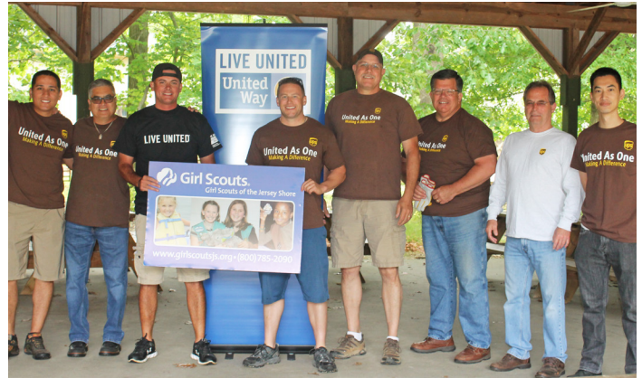
UPS employees spent a Day of Caring volunteering at Girl Scouts of the Jersey Shore's Camp Sacajawea getting it ready for the summer.

Thank you to UPS for your hard work and dedication in delivering goodwill to our community!