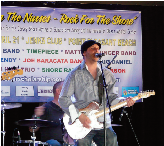
NINE BANDS ROCKED FOR AREA NURSES AND FOR THE SHORE AT A DAY-LONG FUNDRAISER HELD AT JENKS CLUB ON APRIL 21ST.