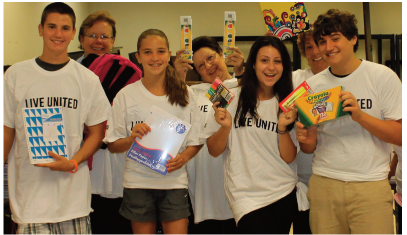
VOLUNTEERS HELP ASSEMBLE BACKPACKS AS PART OF OUR STUFF THE BUS DRIVE, HELD EVERY AUGUST.

On April 21st, a "Rock for the Nurses-Rock for the Shore" benefit was held at Jenks Club to benefit the Jersey Shore victims of Superstorm Sandy through United Way of Monmouth County and United Way of Ocean County, as well as the nurses of Ocean Medical Center through The Barbara Forfar Nursing Scholarship Fund. Bringing together nine bands and hundreds of supporters from the community, this special concert event featured eight hours of live music, food and fun activities.