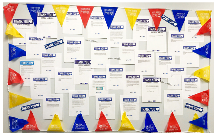
A wall of thank you letters for everyday heroes created by New Jersey Natural Gas employees for the United in Gratitude project.

New Jersey Natural Gas employees and other individuals thoughtfully wrote more than 45 letters which were given to our local heroes at health care facilities and fire stations to lift their spirits.