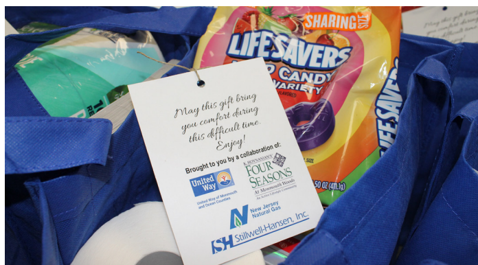
Contents of the Senior Comfort Bags donated to Meals on Wheels in Monmouth and Ocean County.