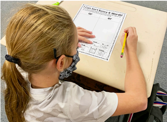
A student doing classwork in the Extended Day Program at Cedar Grove Elementary in Toms River, funded by the UWMOC COVID-19 Recovery Fund.