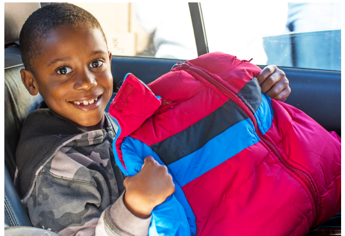
One of the happy recipients of a new coat from Operation Warm Up Jersey Shore.

Over two days in November 2020, hundreds of families attended drive-through events at Fulfill in Neptune and the Church of Grace and Peace in Toms River. Both events were organized and carried out by the distribution partner, Fulfill, which also provided each household with a meal kit. UWMOC board members, community volunteers, and partner staff packed the meal kits and loaded them along with coats into participants' vehicles on each event day.