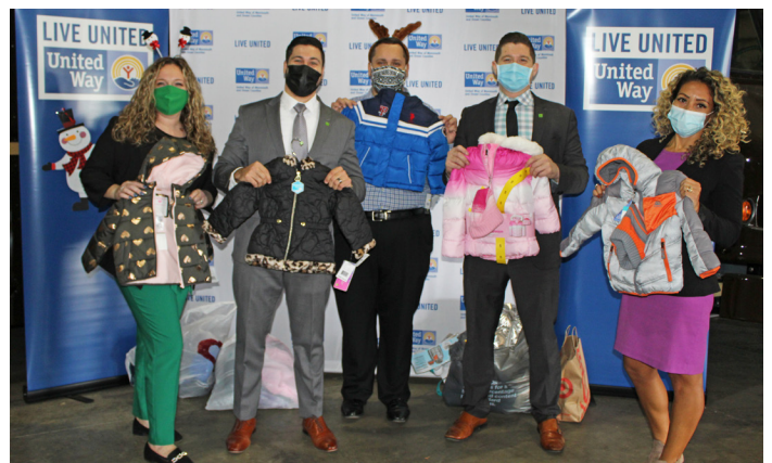
Representatives from TD Banks in Ocean County with some of their generous coat donations.